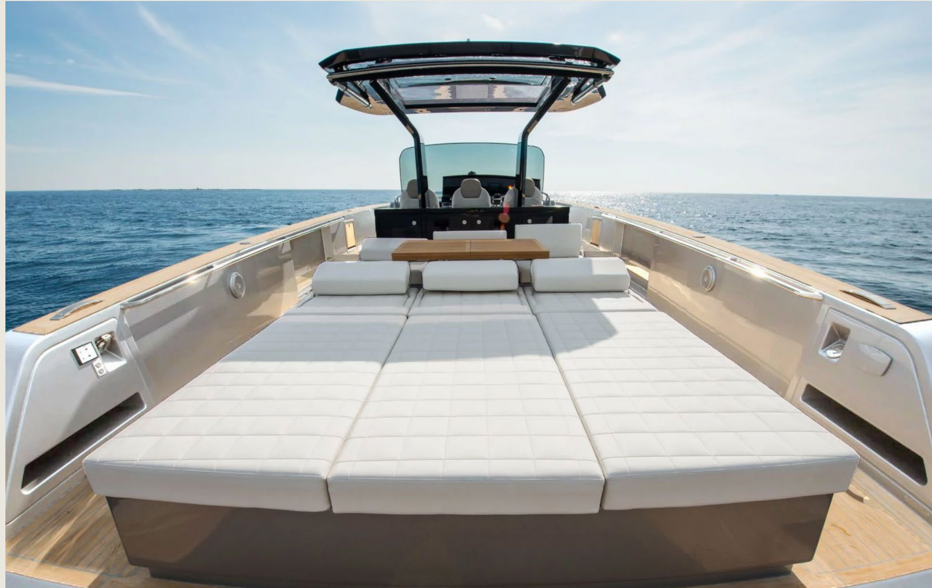
P A R D O 4 3